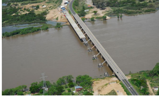
Figure 3. Aerial View of the Original Bridge over the Colastiné River and Construction of the Second Bridge Using the Launching System