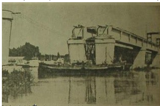
Figure 2. Construction of the Bridge over the Colastiné River. Foundation of Support Cylinders