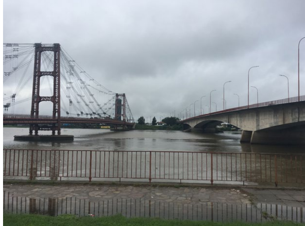
Figure 8. View of the Oroño Bridge (right) and the “Colgante” Bridge Reconstructed in 2002 (left).