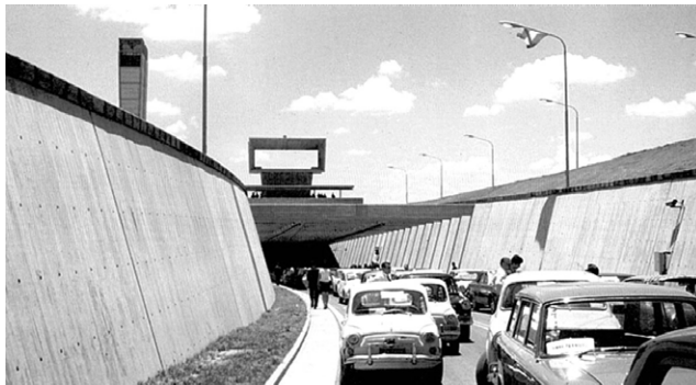
Figure 4. Inauguration Day. Subfluvial Tunnel