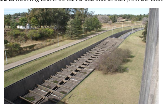
Figure 6. Incoming Beams on the Parana Side as Seen from the Chimneys