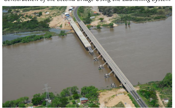
Figure 3. Aerial View of the Original Bridge over the Colastiné River and Construction of the Second Bridge Using the Launching System