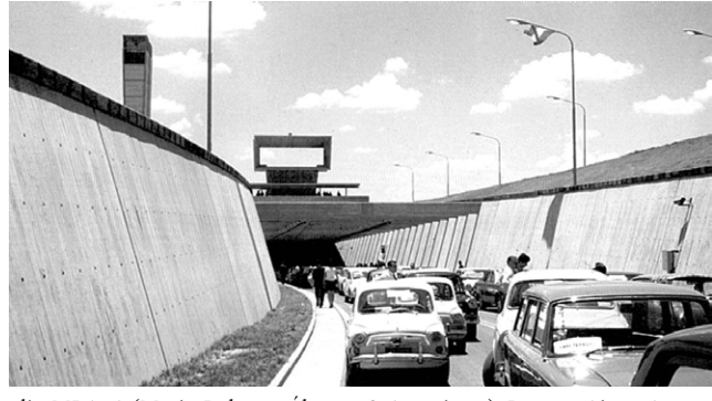
Figure 4. Inauguration Day. Subfluvial Tunnel

Local people feel very proud of their tunnel. In the first place, it has given value to their daily lives, but then, it gained a renewed recognition in terms of its aesthetics, since, among other things, it has been used as cinematographic settings and photographic exhibitions (figures 4, 5 and 6).