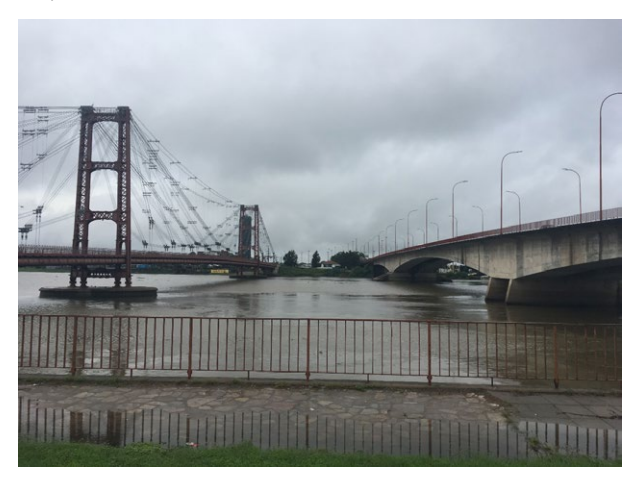
Figure 8. View of the Oroño Bridge (right) and the "Colgante" Bridge Reconstructed in 2002 (left).