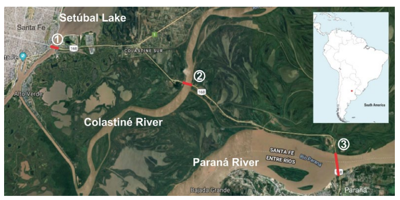
Figure 1. National Route 168 (Santa Fe-Entre Ríos, Argentina) and the Three Cases of Study. 1- "Nicasio V. Oroño" Bridge 2 - Colastiné Bridge 3- "Uranga Sylvestre Begnis" Subfluvial Tunnel

Source: Google Maps, https://www.google.com.ar/maps/@-31.6651185,-60.5796842,21348m/data=!3m1!1e3 Consulted: October 21st, 2019.