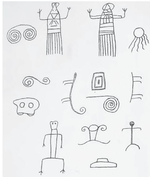
Figure 1. Some of the “picture-writings” recorded by Wallace. 45

Wallace also made a comprehensive list of words in several different Indian languages. On more than one occasion, he wrote in his book about having asked members of different indigenous groups, who also spoke the Língua Geral learned by him, to gift him with a vocabulary of their native languages. 42 These vocabularies collected by Wallace were later studied by philologist and ethnologist Robert Gordon Latham (1812-1888), who wrote a few remarks about them in an appendix to the first edition of Wallace’s travel book. 43 The subject seemed to interest him very much and part of his studies were devoted to what he called “picture-writing,” 44 which he had seen engraved on rocks along the Amazonian district. The carvings, also called “rock-pictures” by Spruce, are also discussed and illustrated on his book.