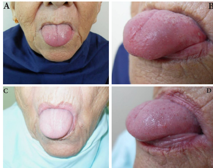
Figure 1. Glossitis due to vitamin B12 deficiency, before (A, B) and after treatment (C, D)

Vitamin B12 deficit diagnosis was performed with hematological manifestations given by macrocytic anemia, neurological manifes-