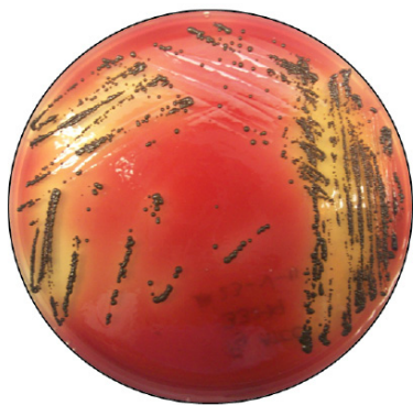
Figure 1. Colony of P. gingivalis , W83 strain, cultivated in blood agar. These are observed in black due to their capacity to attract iron from the culture medium.

FimA fimbriae adhere to different proteins of eukaryotic cells like fibronectin, collagen, laminin, the proline-rich protein derived from saliva and statherin, as well as to prokaryotic proteins like glyceraldehyde-3-phosphate dehydrogenase (GAPDH) of Streptococcus oralis .