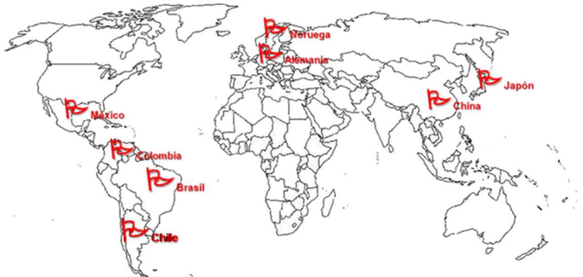
Figure 2. Geographic distribution of world populations where studies have been done on Genotipification of the fimA gene of Porphyromonas gingivalis .

found that in patients with periodontitis the type II (47.4%), type Ib (13.5%), and type IV (12.5%) genotypes are relatively more prevalent compared to healthy patients, who presented frequencies of 50.4% in type I and 12.2% in type V. Likewise, this study reported that the odds ratio (OR) for the adult population in Japan (indicating the relationship between periodontitis and fimA ) was higher for fimA II (OR 77.80 with 95% confidence interval of 31.0 – 195.4).