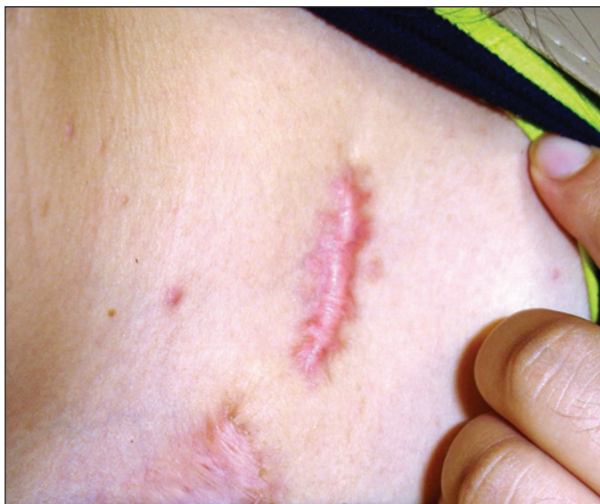
Figure 3 - Donor site hypertrophic scar

niques for cicatricial ectropion correction such as flap rotation or sub orbicularis oculi fat (SOOF) lift were not suitable in this case because of the extensive scarring around the inferior eyelid. The risks and benefits of the intervention must be discussed with the patient before surgery.