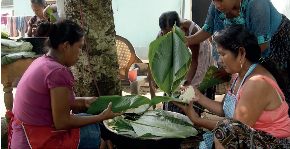
Figure 5. Preparing ceremonial tamales with xeel leaves

yet again. Again, xeel refers to the green leaves that are used for making the tamales and that are re-distributed to wrap up food leftovers to take home (See Figure 5).