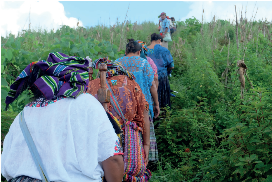
Figure 6. Walking behind