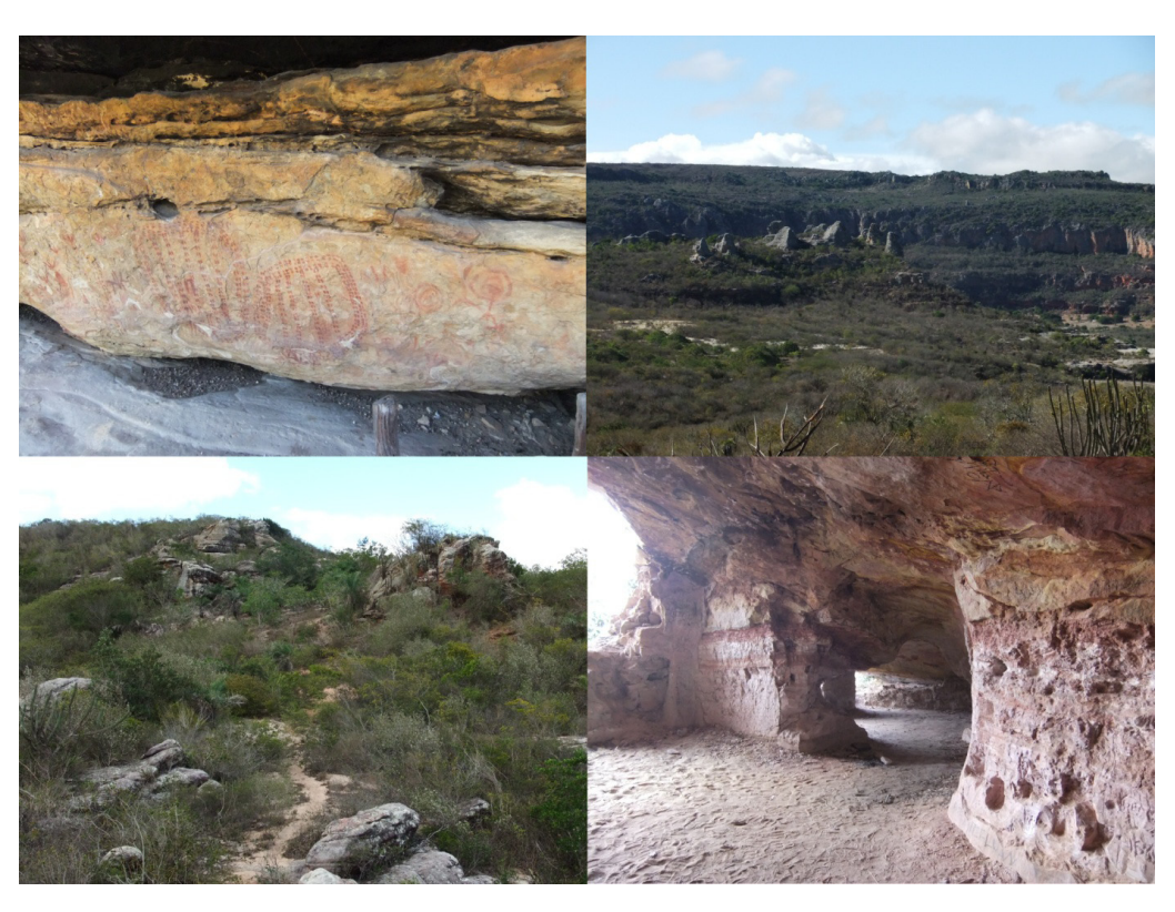
Figure 2. CNP photos illustrating some of its archaeological richness, varied landscapes, biological diversity and geomorphological rarities.

A similar proposal was made and approved for the Pontões Capixabas National Park (Espírito Santo State - Brazil). The park was created in 2002 as a National Park and soon motivated several social conflicts among the 583 families living inside its borders. Unwilling to leave their homes, the residents claimed their right to be heard and to be included in the conservation projects for the park. After several hearings, law Nº 11.686, June 2nd 2008, modified the National Park of Pontões Capixabas category to Natural Monument of Pontões Capixabas. This modification allowed residents to maintain their properties and continue with farming activities providing they employed sustainable practices.