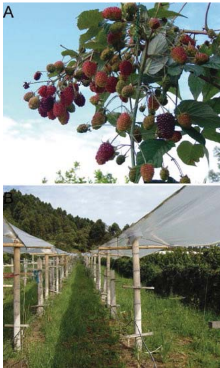
Figure 1. Plant material and semi cover structure. A. Blackberry fruits ( Rubus glaucus Benth cv. thornless) B. Semi cover structure for a blackberry crop.