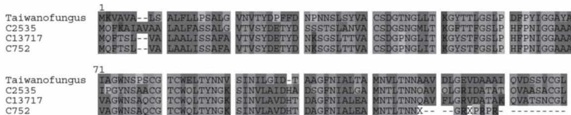
Figure 1. MUSCLE alignment between translated protein sequences of the candidate immunomodulatory proteins from Ganoderma australe against the immunomodulatory protein sequence from Taiwanofungus camphoratus .

The immunomodulatory protein from G. australe , inferred from contig c13717 in this study, as well as those reported from Tai. camphoratus and Tra. versicolor , show a predicted protein architecture composed of an 18 amino acid residues signal peptide and a cerato-platanin conserved domain, which is present in proteins within the cerato-platanin protein family. This family contains phytotoxic proteins of approximately 150 ami-