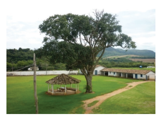
Figure 6. The yard. Old Slave quarters to the right and kiosk for horse buyers (former pillory). Date: 2013

space. In this yard was also constructed a rustic kiosk for buyers of Mangalarga Marchador horses could sit and watch them. In the same place was built a new service area and kitchen. Just below this place, still in the same yard, a small area was fenced with bamboo and wire where was cultivated flowers and ornamental plants, called by the owners - greenhouse.