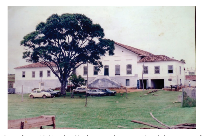
Figure 7. Photo from 1960s, detail of a greenhouse to the right corner of the photo.

Everything indicates that the front yard (1) housed around the farmhouse, since the first reform in 1902, a vegetable garden and a garden. Already in 1953, the vegetable garden was removed and the garden was expanded. The travelers' house, located in the side yard 2, was also demolished in the same reform, and the "Old garden" of this yard was transformed into stockyards for deer destined to hunting. In 1985, the farm received some repairs and started receiving many visitors, which made its owner decided to turn it into Hotel-farm in 1993. At that time the garden has received other treatments.