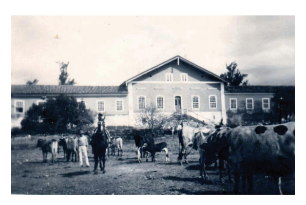
Figure 5. Big House without the second deck and viewpoint. Cows on the lower yard, stockyard waiting probable date: before 1953.

In 1902, it was carried out a major renovation in the Big House, when it was demolished the second floor and removal its viewpoint. After the slavery abolition, the slave quarters was turned off, turning into stockyards and farm implements deposits. The yard 4 (Figure 2) that housed a pillory before, turned into a waiting stockyard for cows would be milked and pasture for their calves.