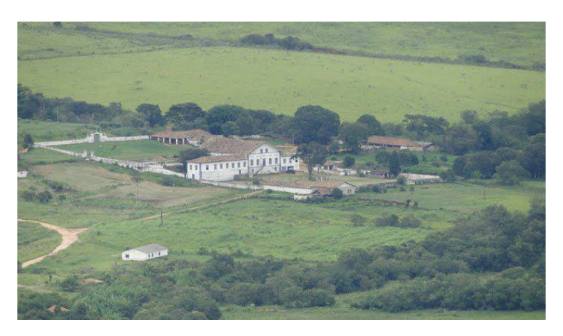
Figure 10. Imposing construction of Traituba's Farm.

In the 1980s, Alice Junqueira feels the need to make a reform in the home just as maintenance, the whole house was painted of blue and white, and other repairs throughout the farmhouse. The renewal of the immense buildings of Traituba 's Farm (Figure 10) drew the attention of the Royal Road tourists that began to be interested in the history of the farm.