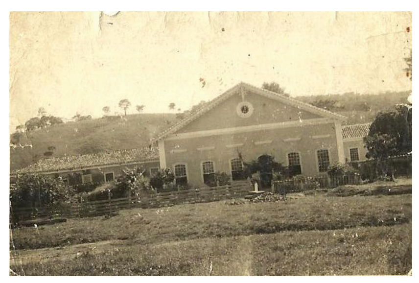
Figure 8. Garden and vegetable garden's entrance before the reform in 1953.

(Figure 8). In this garden cultivated a great diversity of species, but without any organization in beds or defined paths. Among the cultivated species, are mentioned Hortensia ( Hydrangea macrophylla ), Roses ( Rosa sp. ), Christmas cactus ( Schlumbergera truncata ), Lacy tree philodendron ( Philodendron bipinnatifidum ), Sago palm ( Cyca revoluta ), Crown-of-thorns ( Euphorbia milii ) grown in cans, and a Palm tree species ( Coccothrinax barbadensis ) and different species of cacti. There is also some bougainvillea ( Bougainvillea sp. ), one of which formed an arch at the entrance gate and another covering up an water tank in this garden.