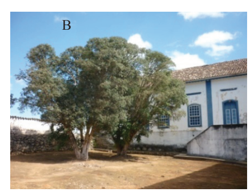
Figure 4. Left yard, Old Garden; Stockyard for deer (A, B). Structural basis of old guest house (A). Date: 2013.

The stockyard and orchard are located outside the walls. Alongside this orchard was planted and cultivated a large vegetable garden, called by the family as old garden. Even being in the nineteenth century, this presence of the orchard and the vegetable garden around the farmhouse refers to the gardens of medieval European monasteries that also had utility trait in detriment of flowerbeds (PAIVA, 2008).