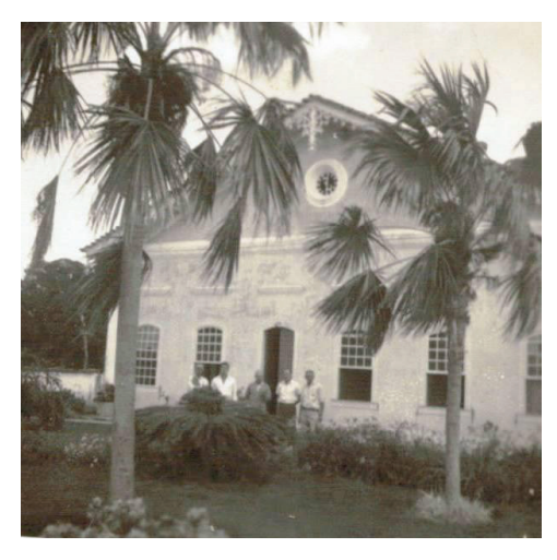
Figure 9. Entrance Garden. Date: 1960s.

The many species found in this garden were arranged in beds structured by some settled cobblestone paths. It was also built a concrete pool and a doll house at the other end of the garden. So, this garden has become a contemplation scenery, home beautification, and family leisure and also for their guests (GARCIA and SALGADO, 2013). But there was no intervention in the old garden, located in the yard 2. This area, after having become stockyard for deer, was almost devoid of plants, leaving only two major jabuticaba tree. As for the main orchard, continued to