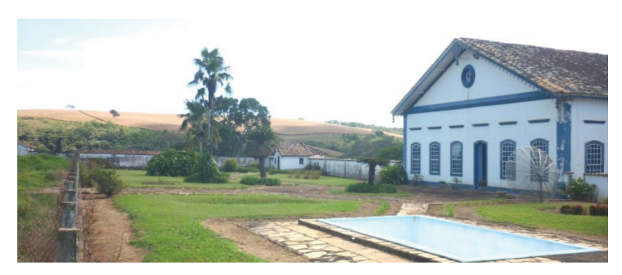
Figure 12. Entrance Garden of Traituba's Farm. Date: 2013.

and Palm tree (Coccothrinax barbadensis). Over time other species have been introduced, and today there are: Hemerocale (Hemerecallis x hybrida), African lily (Agapanthus africanus), Bird-of-paradise flower (Strelitzia reginae), Garden croton (Codiaeum variegatum), Pomegranate (Punica granatum), Azaleas (Rododendum sp.), Heliconia (Heliconia sp), Jungle flame (Ixora coccinea), Purple secretia (Tradescantia pallida var. pupurea), Nandina (Nandina domestica).