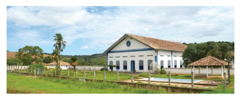
Figure 1. Traituba's Farm, Cruzília-MG. Date: 2013.