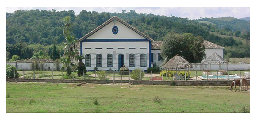
Figure 11. Entrance garden: 1990s.

For about ten years, the entrance garden remained without major changes. In 2004, the farm was again reformed only for the purpose of maintenance and, therefore, some minor changes were also made in this garden. A kiosk was removed and was replaced by another made by brickwork.