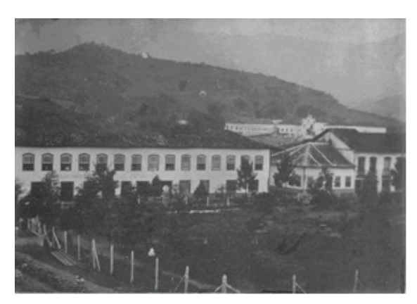
Figure 5. Pictures of the Garden - Independencia Square .

It does not appear in these images (Figure 5) the presence of "fountain surrounded by iron fence" as stated in the book of Terms of auction of the city council of Mariana. Considering that the trees of the image already present with a considerable development and possibly were