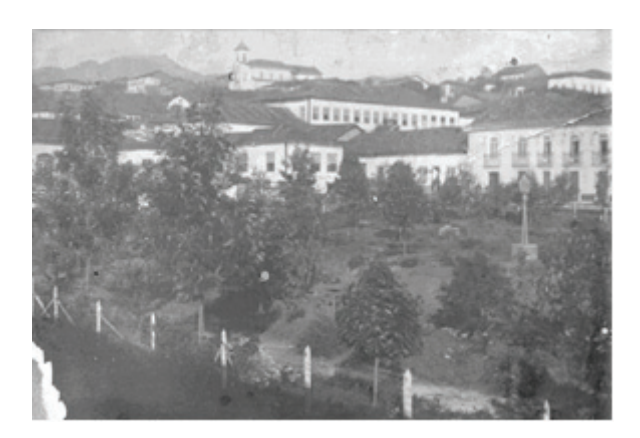
Figura 6. Garden of Independencia Square.

Square has lighting that work-based carbide Queiroz (2002). Lampposts can be identified in Figure 6.