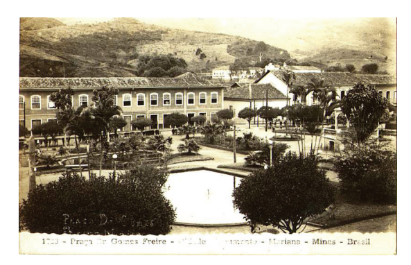
Figure 9. Postcard: Garden of Gomes Freire's Square. IPHAN Archive - Mariana. Probable date: after the 1945.