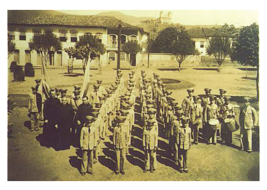
Figure 8. Civic event in the Garden of Independencia Square.

The square also has civic importance beyond the parties commonly performed. For example, the presentation of a band and military alignment portrayed in the picture (Figure 8). Although the image has as its main focus portray the event, it is possible see the alignment of trees surrounding the square, and that they are presented with a more developed size, that of the previous picture (Figure 7). In this image not displayed neither fencing nor the wall, as well as sidewalk for circulation, which allows inferring that it is prior to 1920.