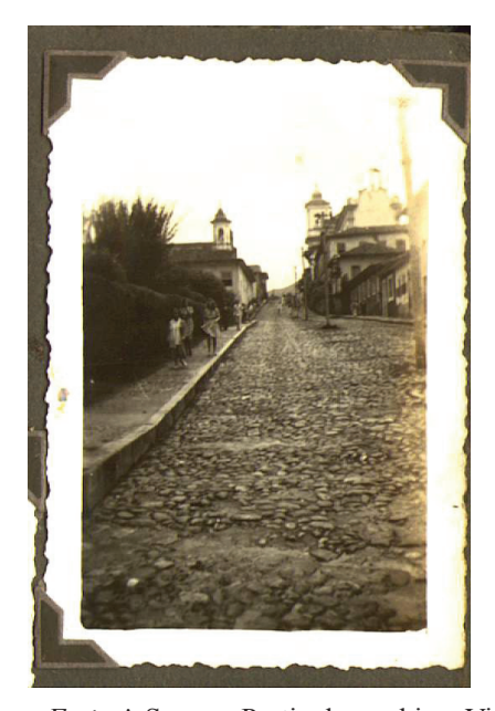
Figure 11. Garden of Gomes Freire's Square. Probably date: 1950s