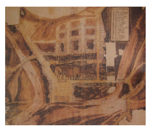
Figure 2. Map drawn in 1745 showing the episcopal city of Mariana .

The village of Carmo found it quite fallen to receive the bishopric, then the king decided that a new town should be built and thus a new city was built in the " Campo da vila ", that is, besides the Rossio land (Figure 2). Such land referred as "field" or " Cavalhada fields" were owned by the crown and had already been requested by the city council since 1740 (FONSECA, 1998).