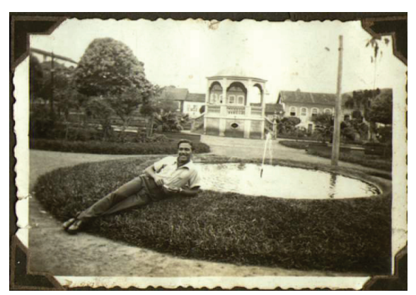
Figure 10. Gomes Freire's Square. Particular archives: Lirim (left.) and Vieira (right). Probably date: 1950's