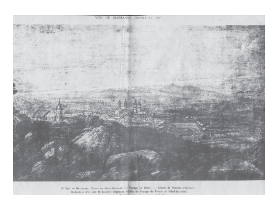
Figure 4. Picture of the Mariana view in 1813.

The taste for excursions and the walks on the cities' surroundings, stylish Gilpin, trying to see the scenery, has become a fashion in the nineteenth century. This European practice was imported by foreign travelers as they passed by Mariana , not concentrated in its urban beauty, looking the landscape on the cities' surroundings, where one can notice some sort of poetic description or graphic representation, for example the picture of Prince Maximilium Wied-Neuwied has a Mariana vision in 1813, in the picturesque spirit of the time: the city seen from the cities' surroundings. It can be seen in the second plan of this image (Figure 4) the presence of a large Largo to the right of the two churches, and behind the main church, where today is the Gomes Freire's Square.