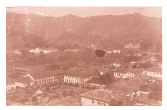
Figure 7. G arden of Independencia Square seen from the tower of the church Nossa Senhora do Carmo .