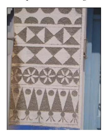
Figure 2. A design with symmetry and patterns from a house façade.