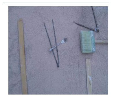
Figure 1. Tools: a lath, a compass, a divider.

Xysta craftsmen use particular tools: a lath (straight edge); a compass with two identical points; and a fork for scratching some areas of the figures so that one shape becomes dark (the scratched one), and the other white.