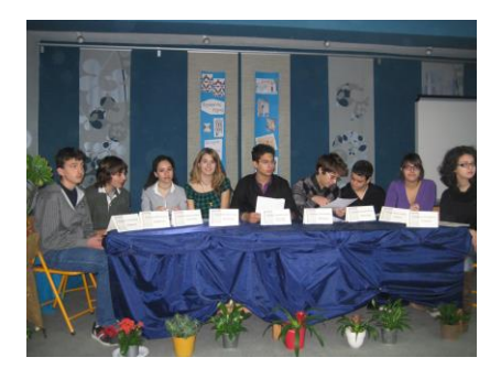
Figure 7. The panel.

Students further identified several kinds of symmetry that appear in 'xysta'—from photos of houses and from craftsmen's constructions. They noticed that craftsmen constructed, in their own apprenticed methods, parallel lines, rectangles, rhombi, squares; they found the center of a rectangle; and they divided a circle into six equal parts, leading to the creation of a regular hexagon.