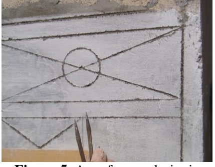
Figure 5. A craftsman designing a rectangle.

In summary, students studied the pictures of house surfaces and of craftsmen's constructions, and searched for mathematical notions, as well as the type of their construction. They then followed the guidelines provided and ccompleted the project by organizing a roundtable TV show.