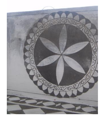
Figure 3. A circular design from a house façade.

Furthermore, some pictures of craftsmen at the time they were working on 'xysta' were provided to the students as additional material. Here are samples of these pictures.