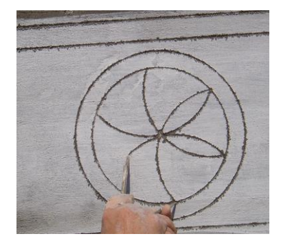
Figure 4. A craftsman designing circularly shaped patterns.

Furthermore, some pictures of craftsmen at the time they were working on 'xysta' were provided to the students as additional material. Here are samples of these pictures.