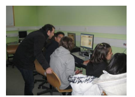
Figure 6. Working through WebQuest.