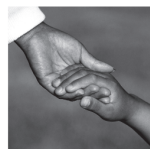
Figure 1. The Situation of English Language Teaching in Colombia

Specialized language teachers to support English in primary grades have disappeared from the public schools.