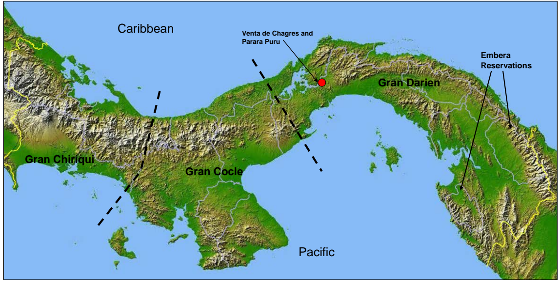
Figure 1. Map of the Republic of Panama showing the location of current Emberá Reservations, the area of Venta de Chagres and Parara Puru, and the three major Precolumbian cultural interaction spheres.