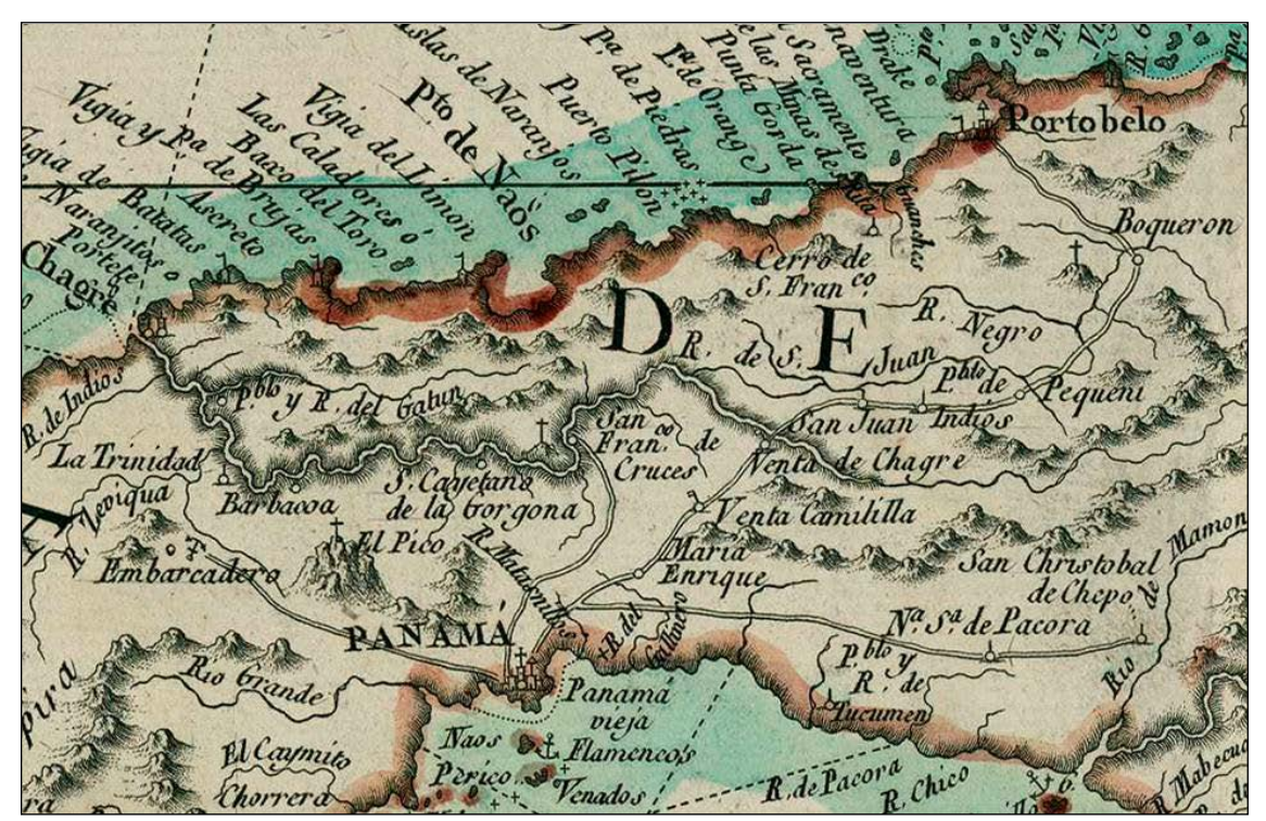
Figure 4. Fragment of Map of Tierra Firme or Castilla de Oro (Panama) in 1785, by Don Juan Lopez, showing the route of the Camino Real from Panama City to Portobelo, and the Chagres river (Source: Bibliothèque nationale de France, département Cartes et plans, GE SH 18 PF 143 DIV 10 P 6).

The Camino Real is the overland trail that connected the terminal cities on both oceans across the isthmus, Panamá on the Pacific and Nombre de Dios on the Atlantic. Its passage was swifter but much more expensive than travelling along the Camino de Cruces – the cheaper, longer, safer, more comfortable and better historically known route – which connected the same destinations but through a mixed terrestrial and fluvial way along the Chagres river. They were both used from the third decade of the 16<sup>th</sup> century onwards, when the Camino Real was simply an open path through the jungles until it was partially paved at the end of the century. Real was error trails were crucial in maintaining the commercial, tributary and political links between Spain and its South American empire, and witnessed the passing of over 60% of all the gold and silver taken to Europe in the 16<sup>th</sup> and 17<sup>th</sup> centuries, sepecially so over the Camino Real which was designated as the only possible