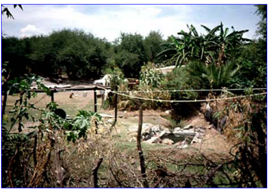
Fig. 10. Neighbors living by the thermal spring grow vegetables in the warm ground and have their own spa.