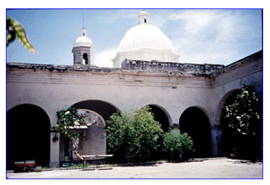
Fig. 5. Interior patio built in the Spanish style. The church dome and top of the bell tower appear in the background.

But parts remain. Of all the buildings in the complex, the spa itself was most unaffected by destruction through the years, probably because it is a solidly built, single-story building. It is a large structure of carved stone blocks laid out along a large, open interior patio in the Spanish style (Fig. 5). Private, two-room suites for thermal bathers lead off from the breezeway around the patio and a different saint's name is painted brightly over the doorway for each (Fig. 6). Anyone entering a suite, sick or well, would be under the patronage of this saint, who would receive the visitor's prayers and act as a custodian.