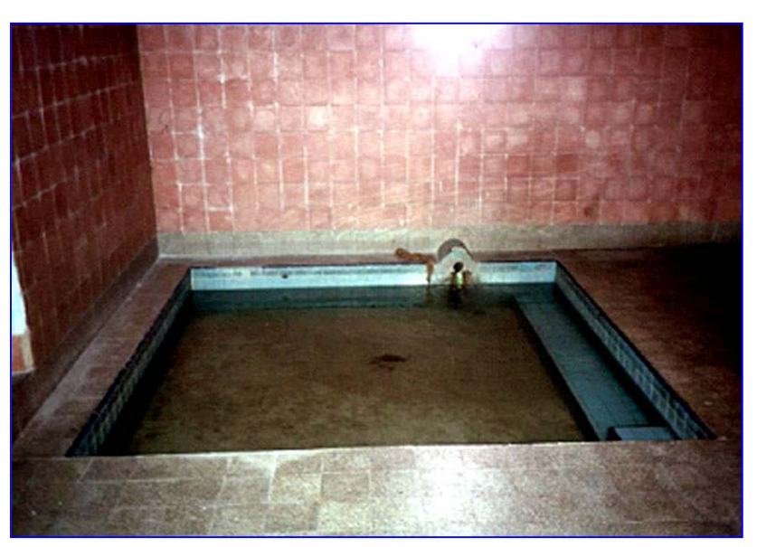
Fig. 7. In the chamber with a thermal bath, part of a two-room suite.

Hot waters from the spring pour down to the spa through an elegant, stone aqueduct (Fig. 11). Once the thermal waters reach the spa, they are still too hot to use and must cool before entering the bathing chambers, a process that occurred originally in two stages. As water arrived, it flowed first from the aqueduct into one of three stone troughs by slowly falling over a series of riffles, an air-cooling process that somewhat lowered the temperature (Fig. 12). Next the thermal water was moved to a fourth stone trough where it was mixed with cold water until a temperature was reached that bathers could enjoy. Today a pipeline circumvents this cooling system, although the troughs and riffles still are there to see.