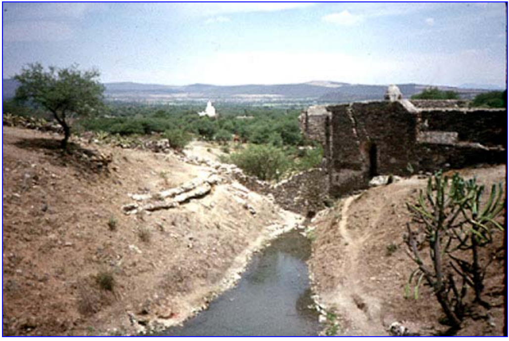
Fig. 9. Thermal waters from this spring flow into the aqueduct that goes down to the spa. The church dome in the spa complex is visible in the distance

Do you know more about San Bartolo Agua Caliente? Please e-mail me. I would be very interested to hear from you.