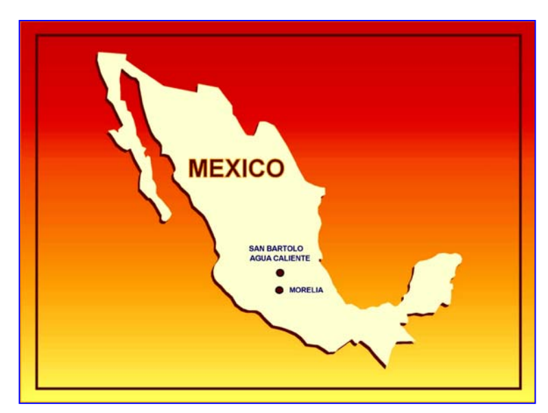
Fig. 1. Location of San Bartolo Agua Caliente.