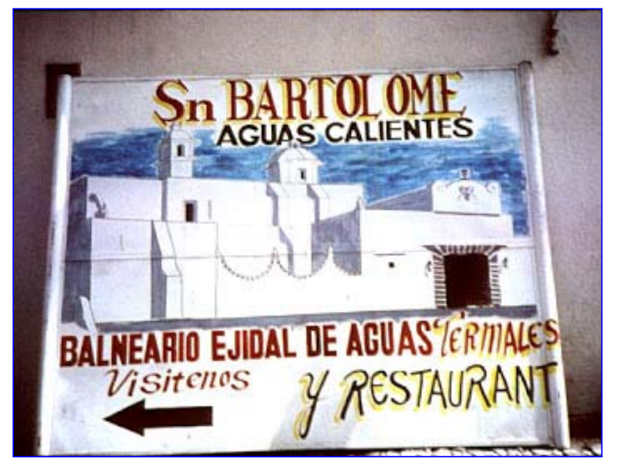
Fig. 2. Sign outside the complex welcoming visitors to the spa and restaurant, today communal property owned and operated by an ejido. The spa entrance is the bricked archway on the right, the central dome covers the church ruins, and the bell tower is on the left.

For good reasons, the dates of the sketchy and mysterious story of the complex do not correspond exactly with the sign at the door reading 1599-1802, but they come close. In fact, the 203-year period noted on the sign in Figure 3 is critical to the history of the