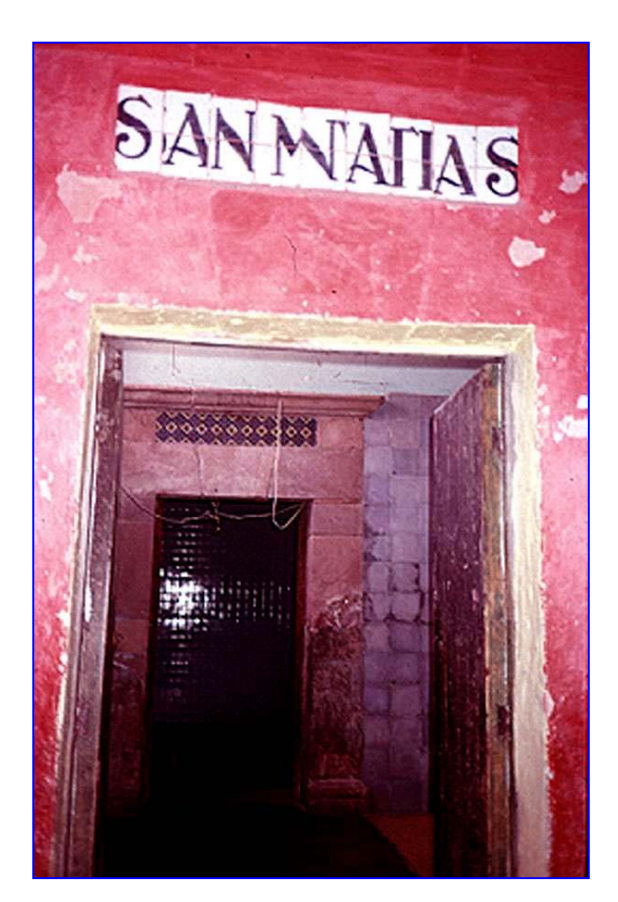
Fig. 6. Entrance to a two-room suite at the spa. Each suite has a different saint's name painted over the doorway.