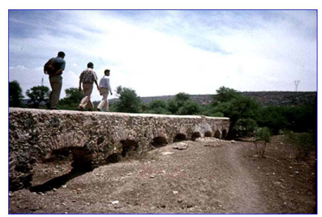
Fig. 11. The aqueduct goes down to the spa complex.

Noticias para Formar la Historia y la Estadística del Obispado de Michoacán (1860). Gobierno del Estado de Guanajuato, p. 145.