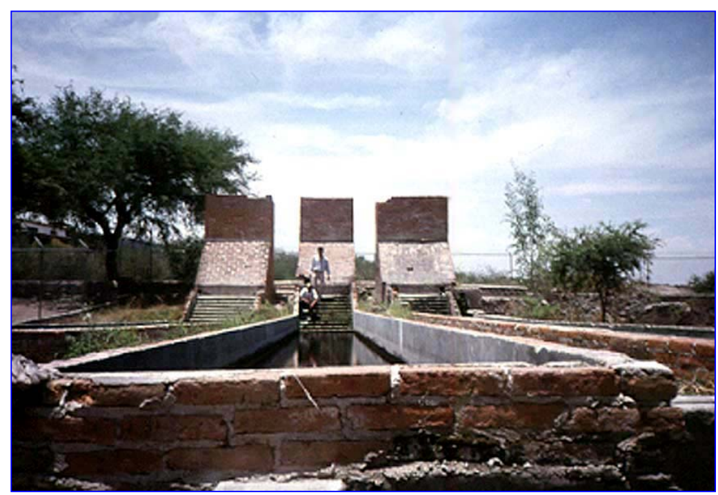
Fig. 12. The original water-collection troughs built at the spa. At the far end are the riffles the thermal waters tumbled over on leaving the aqueduct, the first of two cooling processes. Next the waters were mixed with cold water from a fourth trough until a good bathing temperature was reached.