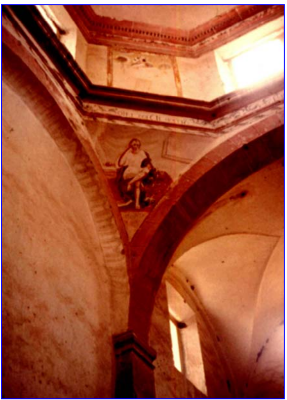
Fig. 4. Niches by the arches around the church dome are decorated with delicate paintings of the apostles at rest, some washing their feet, suggesting the religious nature of healing experiences in the spa's thermal waters.

suite is designed Each somewhat differently and some are larger than others. But all have two rooms, an antichamber for changing before entering the inner chamber with the thermal bath itself, everything built of solid stone massive, shadowy, peaceful, and cool (Fig. 7). All thermal-bath chambers have domed ceilings with cupolas whose tops are open, allowing light and air to enter and steam to escape (Fig. 8). Propelled by gravity, the thermal waters pour through original plumbing into the large, handcarved thermal basins cut in the floor.