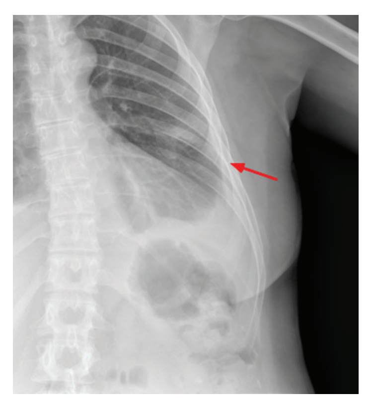
Figure 1. X-ray of left rib cage which may show partial disappearance of the 6^{th} left lateral and anterior rib arch.

The thoracic X-ray reveals pleural effusion which occupies two thirds of the left hemithorax and the left rib cage. Partial absence of the 6th left costal arch may be appreciated as well (Fig. 1).