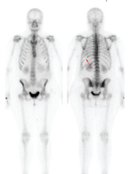
Figure 2. Bone scintigraphy reveals partial absence of the 10^{\text{th}} left posterior rib arch.

Thoracentesis was performed for evacuation with output of serosanguineous fluid with the following analytical data: glucose 97 mg/dL, LDH 179 UI/L, erythrocytes 571,100/μL, leukocytes 11,620/ µL (3% polymorphonuclear, 97% mononuclear), proteins 5.3 g/dL, pH 7.43, rheumatoid factor 9.1 UI/mL, amylase 27 UI/l, cholesterol 86 mg/dl, triglycerides 26 mg/dl, adenosine deaminase (ADA) 13 UI/L. Negative flow cytometry of the pleural fluid for lymphoid infiltration. Cytology of the fluid without cellular atypias. Cultures of the pleural fluid for bacteria, mycobacteria, parasites and fungi were negative. Also, the Mantoux test and the gamma interferon test with quantiferon-TB(r) were negative for latent tuberculosis infection. The serology tests for hepatotropic viruses and human immunodeficiency virus (HIV) were negative. The mammography and the gynecologic ultrasound were normal. Both the bone scintigraphy (Fig. 2) and the CT scan (Fig 3), thoracic MRI and PET revealed hypoplasia and an osteolytic lesion in the 10th and 6th left rib arches together with effusion, significant left pleural inflammation and involvement of adjacent soft parts.