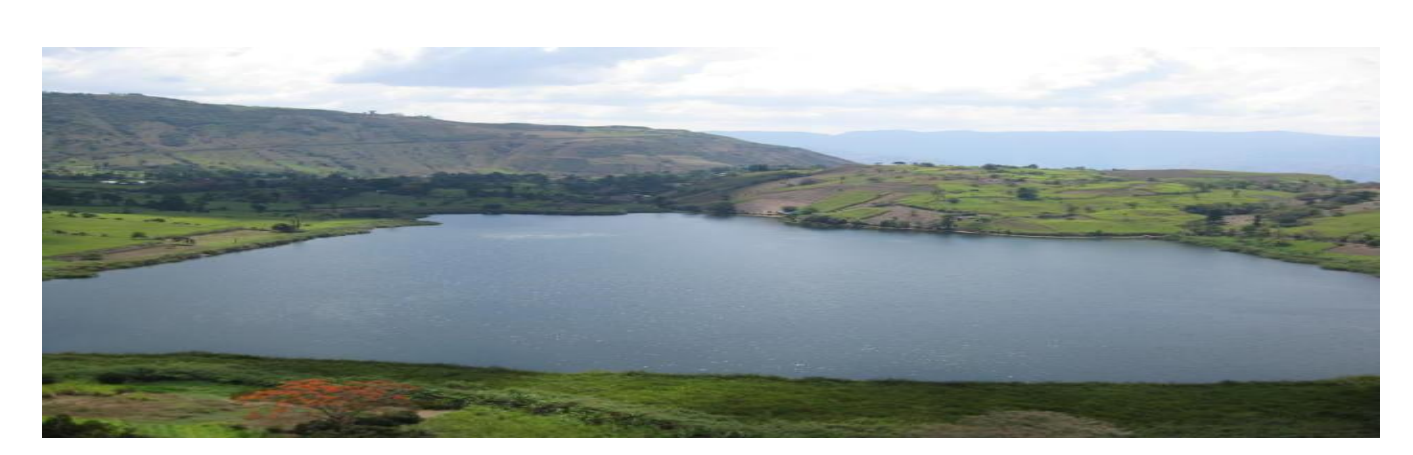
Figure 2. Los Ortices lagoon, San Andrés, Santander. Colombia.