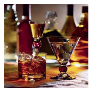
Poster taken from www.boatandmarineinfo.org