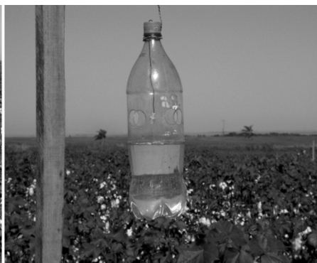
Figure 2. PET trap.

The third experiment assessed the nocturnal circadian rhythm, by means of the traps previously described, on April 23, 24, and 27, during the 2001-02 growing year. During the 2002-03 growing year, nocturnal evaluations were performed on April 29, May 13, and June 3, all in 2003. In order to determine when P. gossypiella sexual activity peaked, we counted all individuals captured in each trap, the counts being performed every hour from 7:00 p.m. to 5:00 a.m. (local time). We recorded the temperature and relative humidity at the time of each of the evaluations, which were performed on an hourly basis. We performed a descriptive analysis of the data collected.