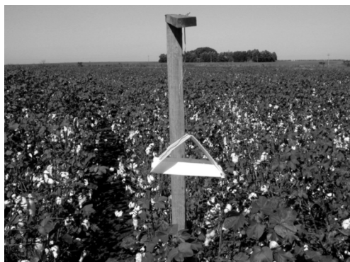
Figure 1. Delta trap.

2003, a total of 35 evaluations having been performed. We tested the following traps: (1) a commercially available Delta trap, as described in the previous paragraph (Fig. 1), and (2) a polyethylene terephthalate (PET) trap, which consisted of a transparent, 2-L capacity PET bottle in which four symmetrical holes of 2 cm in diameter were made, 17 cm from the base, in order to allow the entry of moths (Fig. 2). In order to capture moths in the PET trap, we filled the bottle with 800 mL of water, together with a few drops of neutral detergent in order to break the surface tension of water and allow the moths to sink. In the Delta trap, the pheromone was hung on the “roof” of the trap, whereas in the PET trap it was placed at the level of the holes. The statistical analysis used in this experiment consisted of comparing randomly groups, and the means were compared by t-test. The level of significance was set at 5%. In addition, we performed canonical correlation analysis using the program GENES (Universidade Federal de Viçosa, Viçosa, Brazil) to draw comparisons between dataset I (comprising data related to the moths captured in the Delta and PET traps) and dataset II (comprising the meteorological data), this was determined to identify, for each group of variables (i.e., dependent and independent), linear combinations that maximize the correlation between the two datasets (Cruz and Carneiro, 2003).